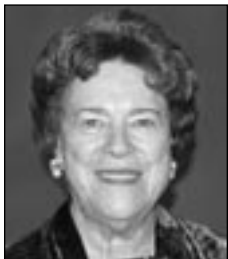
Hon. Claire L'Heureux-Dubé