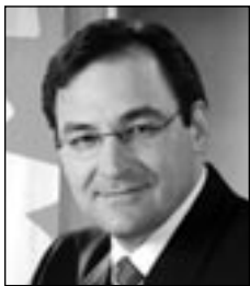
Hon. Martin Cauchon