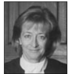
Hon. Marie Deschamps

Remember to make your hotel reservations early to assure your space at the group rate. Contact Westin central reservations at (800) 937-8416 or the Westin Ottawa directly at (613) 560-7000.